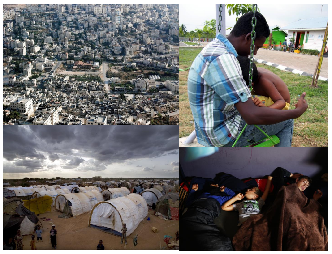
Clockwise from the right: A Rohingya man and his child living in an integrated community shelter, Indonesia. Subject to widespread persecution and violence in Myanmar, thousands of Rohingya take irregular and dangerous boat journeys in an effort to reach safety; Children from Syria sleep on the floor of a camp while seeking asylum on the Greek island of Chios; Ifo camp in Dadaab, Northern Kenya. Tents in this area are close together and used as permanent shelter as there is no land for refugees to build houses; Balata Refugee Camp, the most populated Palestinian refugee camp in the West Bank

States' respective contributions to refugee responsibility-sharing should be proportionate to an objectively defined capacity to host and support refugees. National wealth (for example, GDP or GNI<sup>5</sup>), population size and unemployment rates are all factors that affect a country's ability to host and integrate refugees. While States might add to or modify these criteria, and assign different weighting to each one, they should focus on agreeing a relatively small number of relevant, broadly applicable, common-sense criteria that enable responsibility-sharing.