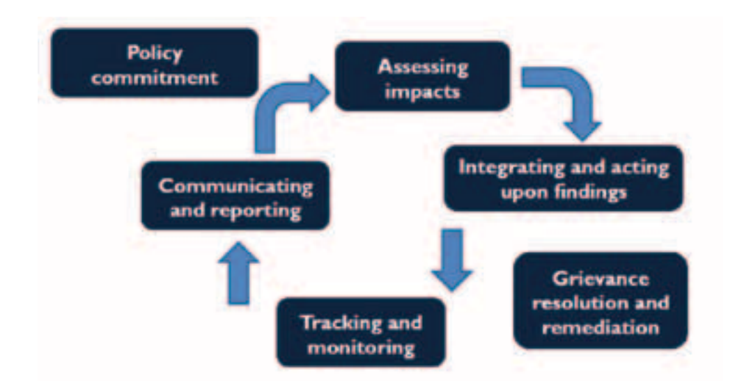
DIAGRAM 1. HUMAN RIGHTS DUE DILIGENCE